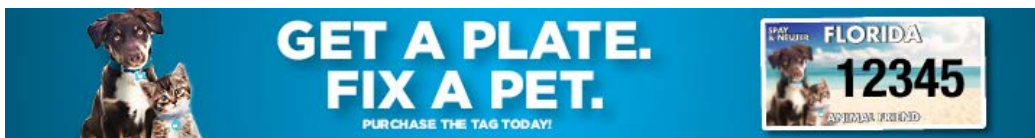
720 X 90

Below are various downloadable banners which promote Florida Animal Friend that would make a great addition to your website or social media platforms. These banners are available for download at http://floridaanimalfriend.org/digital-ads/