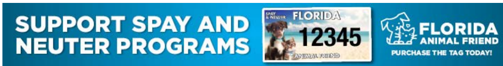
720 X 90