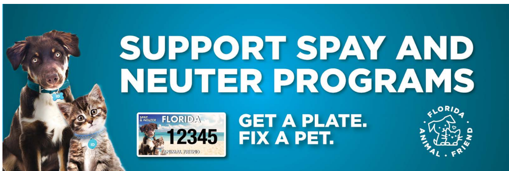
954 X 315