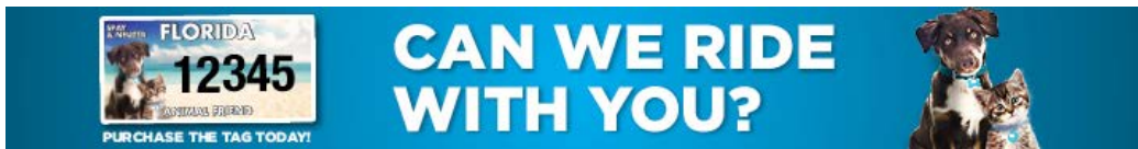
720 X 90